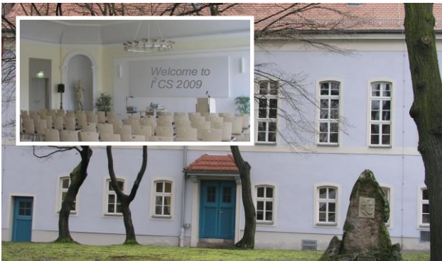
Conference venue: Rosensäule, Fürstengraben

Sessions last 90 min and are separated by refreshment breaks.