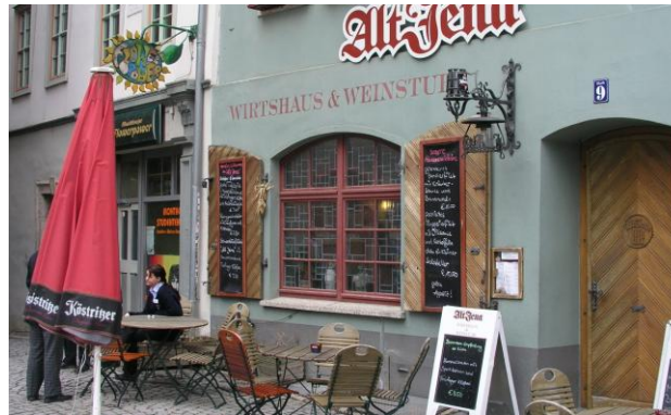
Traditional restaurant at Jena Market Square

Linking tele-TASK video portal to the Semantic Web