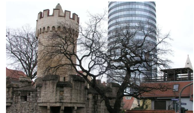
Old & new: City wall tower & Jentower